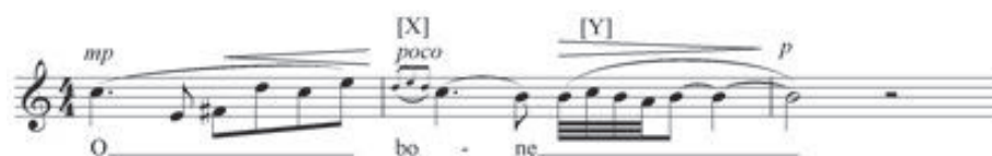
Ex. 2: O Bone Jesu bars 1-3

The opening of O Bone Jesu (Ex. 2) is characterized by the initial wide leaping intervals at the ‘head’ and a descending decorated ‘tail’, the key decorations of which are [X] the upper mordent acciaccatura group, and [Y] the turn, both derived, it seems likely, from the ‘sound’ of the ‘follow-me’ type of Gaelic psalm singing of the N.W. of Scotland which MacMillan has acknowledged as an influence. 4