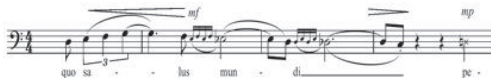
Ex. 4: bars 10-13 Bass 1, section III ('Verily I say unto you') from Seven Last Words

These principal melodic ideas contribute to the structural integrity of the work by defining the tonal framework of the whole, as shown in Table 1 (see Appendix). A certain modal ambiguity is present, even at the very start of the work: the first phrase seems to define an A minor tonality on the basis of the opening interval (E to C) with the final B as apparent supertonic, however, it is more likely that in MacMillan's compositional thinking this is actually a cross between transposed Aeolian mode at the 5th (on E) and E minor. In the opening section at least, MacMillan's tonal palette uses 5th related tonal centres qua modulation: