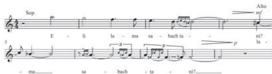
Ex. 8: bars 70-5 'sabachtani' – section IV Seven Last Words from the Cross

Comparison with other choral works of the late 90s such as the Magnificat and Nunc Dimittis (1999) shows that this approach to word setting using mordent or turn-based decorations developed to become a key feature of his vocal style for pointing up significant words in the text (and particularly for those words calling for explicit theological emphasis). 5