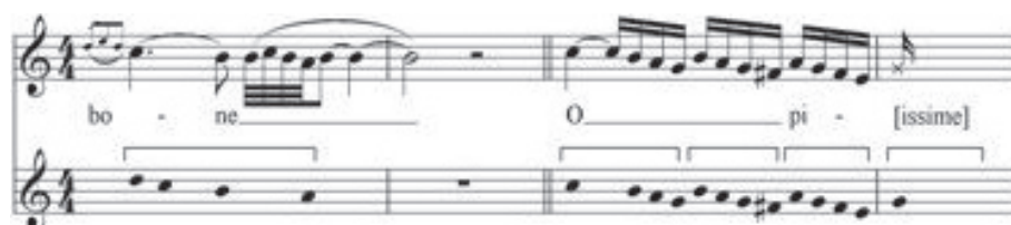
Ex. 3: O Bone Jesu pitch derivation of second melodic idea

The pitch profile of a descending appoggiatura (C–B) within a scalic context generates the second phrase ‘o piissime’ which emerges out of the ‘tail’ of the first phrase using sequential descending quasi melismatic scales. Such melismatic writing often embodies word painting to emphasize what MacMillan views as significant religious text.