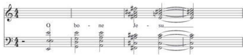
Ex. 6: O Bone Jesu bars 85-7, the Golden Section

The placing of the repeat of the text 'O Bone Jesu' at bars 85-7 (out of 137) is structurally significant in that this is the heart of the work, and specifically the point of the Golden Section which, mathematically at least, occurs halfway through bar 85, co-incident with the start of the phrase. Whether MacMillan planned this strictly mathematically is not clear.