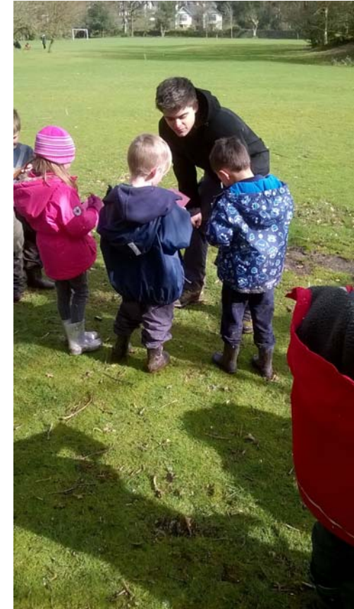
Drawing sound maps

Sensory activities: derived from writings and practice such as Steve van Matre (Earth Education) and Joseph Bharat Cornell. Now often not (or wrongly) attributed and many practitioners are devising their own activities