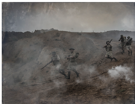
FIGURE 12.3 In the film, the boy tells us two versions of his grandfather's backstory. The first is the heroic myth created by his father and the second reveals the true events. Both versions integrate historical archive footage and are proportioned so that they reference dimensions of documentary material of the period. However, at the point that the grandfather deserts the army, the footage expands into the cinematic dimensions of the boy's contemporary world and the story concurrently extends its colour range.

In a way, Sparrow (2016) is a film of lost stories. Although, currently, much of the Western world is occupied with commemorations of the Great War, such a film poses a counterpoint to the corpus of sanctioned narratives that have