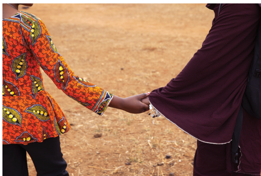
FIGURE 17.2 Friends or something more?

my efforts to explore ways to normalise skewed Western images of Africa. For me as a storyteller, the project has been an experiment in positive storytelling where the final creative result (the treatment) is free to be whatever it will be, without being constrained by cinematic judgements about the quality of the final product. For me as a researcher, the greatest findings have been the positive qualitative results and observations of this creative model and the warm, enjoyable collaborative experience of both the participants and my local team.