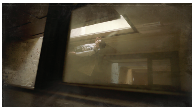
FIGURE 12.6 The boy searches for his Grandfather's room. This sequence was designed as a subtle metaphor for the process of discovering what has been hidden. We do not view him in the normal manner of documentary cinema. We watch from a state of seclusion, perched somewhere awkwardly in the rafters of a building. Here, a world has been opened after many years of secrecy and we are uncertain how to engage with it.

know is not lost. To do this in Sparrow (2016) I have woven together two stories, a young boy's and his grandfather's. They inhabit an enigmatic, visually lyrical world that is connected by a small bird that has been a friend to both characters. The bird is fictional. It is a metaphor for what is constrained and eventually set free. In the story, beauty, brutality, truth and a small fiction play out as a narrative poem about what has been hidden and what can never be fully recovered.