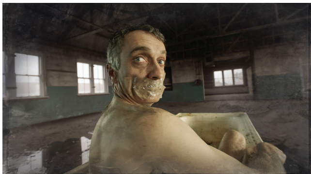
FIGURE 12.5 The loss of speech. For this sequence, I designed translucent, damaged filters that extended the idea of the worn tape pasted over the veteran's mouth. The tape references the hysterical loss of speech that was a common symptom of shell-shock casualties (Reid, 2014).

been generated to reinforce ideals of national loyalty, masculinity, bravery and sacrifice.