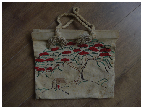
FIGURE 30.2 Embroidered bag

The second object is an embroidered bag, typically for containing a knitting or sewing project. I found it in my mother's house in a chest of drawers that wasn't often visited. It was full of things that had long ago stopped being part of her life; she had moved on and they had stayed behind. I vaguely remembered the bag from many years before. My childhood eye had been drawn to the picture of the little house under the great flowering tree, as though it was in a story. Whose home was that? All I knew was that my mother had got the bag in Jamaica, which was in 1938, when she went to visit her sister who was working there.