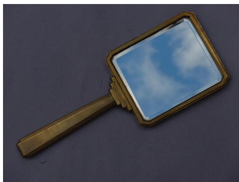
FIGURE 30.3 Hand-held mirror from my mother's trousseau

The proportions are stylistically good, though in fact it's quite awkward to hold, very top heavy. The wrist has to come into play as one moves the mirror around to catch a view of the back of one's head, one's profile, with the use of