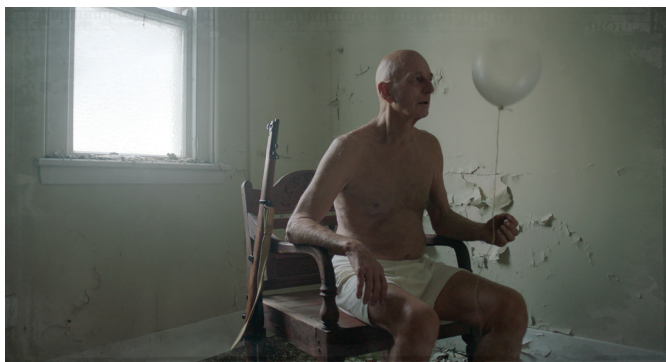
FIGURE 12.4 The thousand-yard stare. In the film, the veteran is unaware of any presence in his room and a balloon is absently released and dissolves inexplicably as it rises upwards.