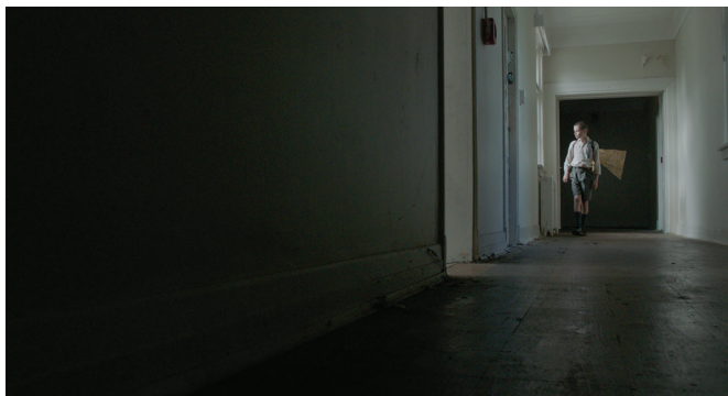
FIGURE 12.1 A small winged boy, who is the story's protagonist, wanders the halls of an abandoned psychiatric hospital where his grandfather died in disgrace. The film Sparrow concerns his search for the truth behind a family myth of heroism and the impact the revelation of his grandfather's actions has on his condition as a bullied child. (The 90-second trailer and preliminary sketches used for the film can be accessed at http://sparrowfilm.nz/ . In 2017, the film premiered in the 35th Chicago Reeling International Film Festival . It was then screened in the 27th Atlanta Out on Film International Film Festival and the 33rd Berlin Interfilm International Short Film Festival .)

■ The footnote 1 has been inserted in the caption of Figure 12.1 as per BTS. Please check for correctness.